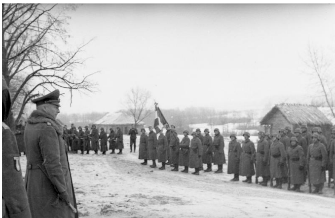
1. November 1941

On the 4 th September 1941 the first convoy of 850 men left France for the eastern front. Two main assembly points were established in Poland, at Deba, near Krakow and Kruszyna about 90 km south of Lodz.