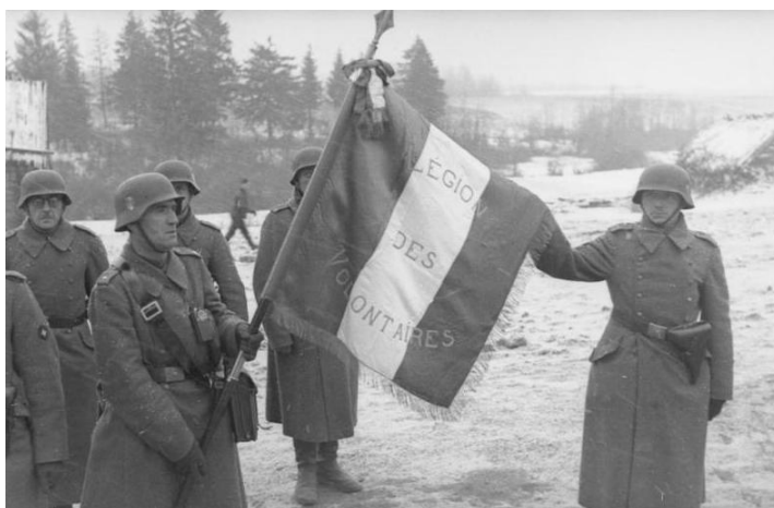
French soldiers in Russia, November 1941

A delegate from the Armistice Commission conducted an investigation and refused to recognise the Legion. That led the Germans to demand of the Vichy French government its dissolution. Hitler banned it on 17 th September 1942. The French government then complied with the Decree No. 1113 of 28 th December, the Legion was dissolved and the members were reincorporated into the LVF.